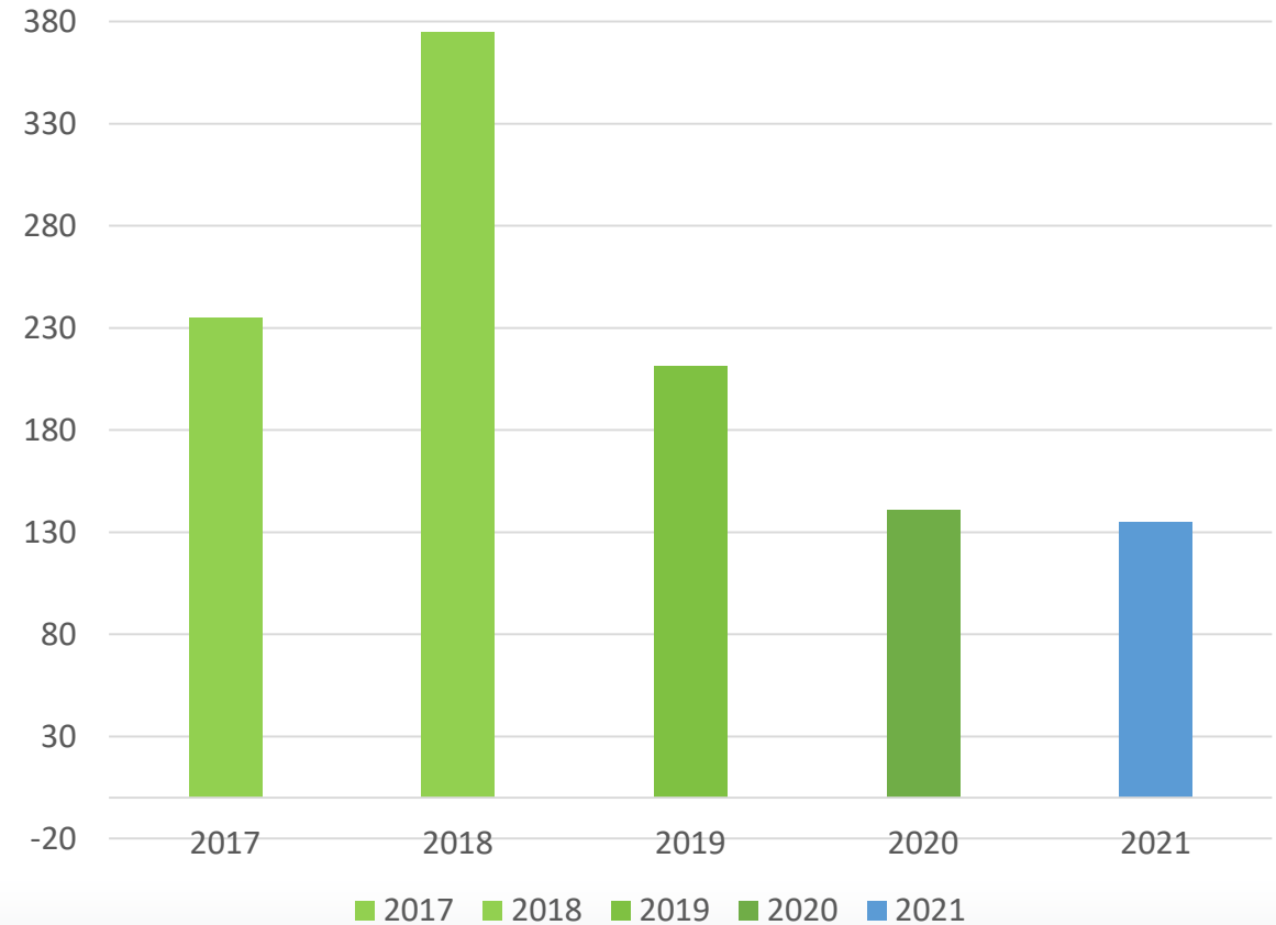
New Single-Family Residences